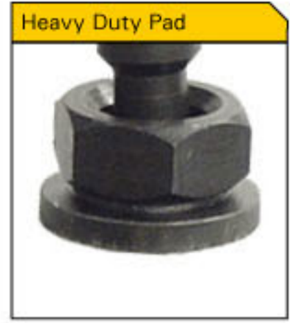
Heavy Duty Pad